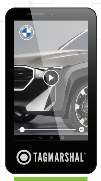
VIDEO AD WITH SOUND